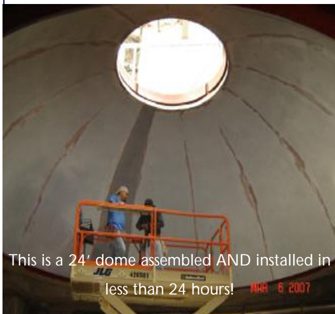
This is a 24' dome assembled AND installed in less than 24 hours!